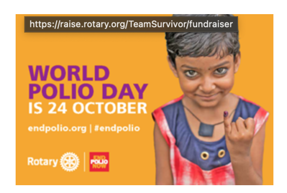
Join us for World Polio Day October 24.