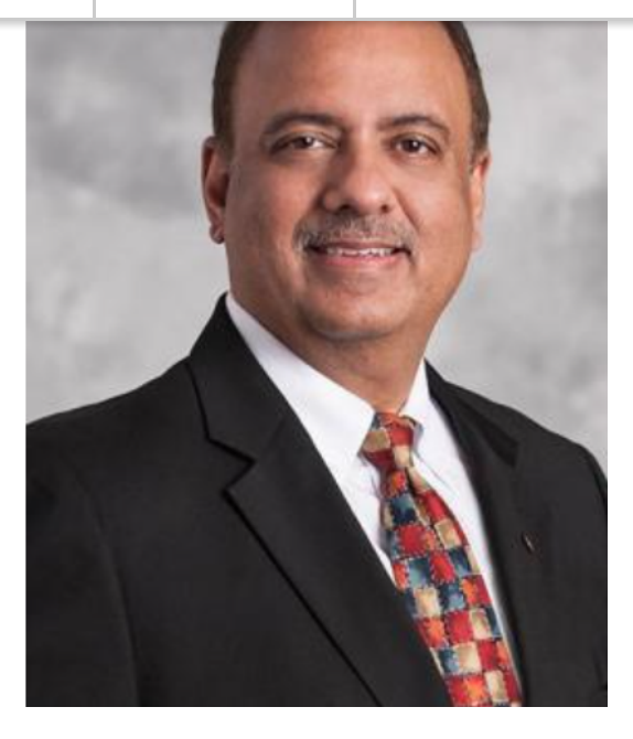
RI's President's monthly message for September.